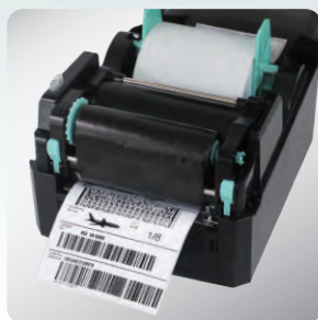
Uses standard low-cost labels and ribbons