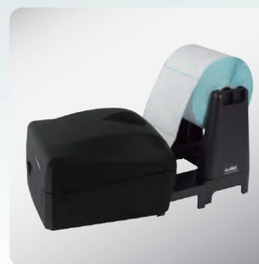
High cost-effectiveness for large amount printing