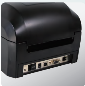
Ethernet, Serial and USB ports included

Use the GE300 for all you light to medium duty thermal transfer barcode printing applications